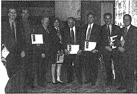
Top Ten Leasing Award Winners for Northern Virginia